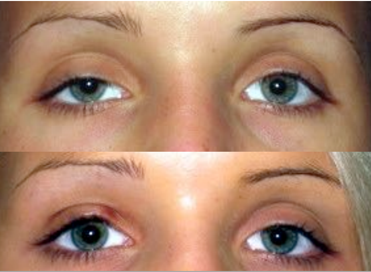
Pictures of before and one week after ptosis correction surgery- This young lady was born with a drooping upper eyelid (congenital ptosis) but only decided that she wanted ptosis surgery when she was in her late teens. Notice the minimal swelling which occurs. This quickly self resolves.